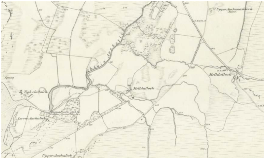
1st Edition Ordnance Survey Map (showing 2 Melldallochs, Tigh Cladaich and upper and lower Auchalick).