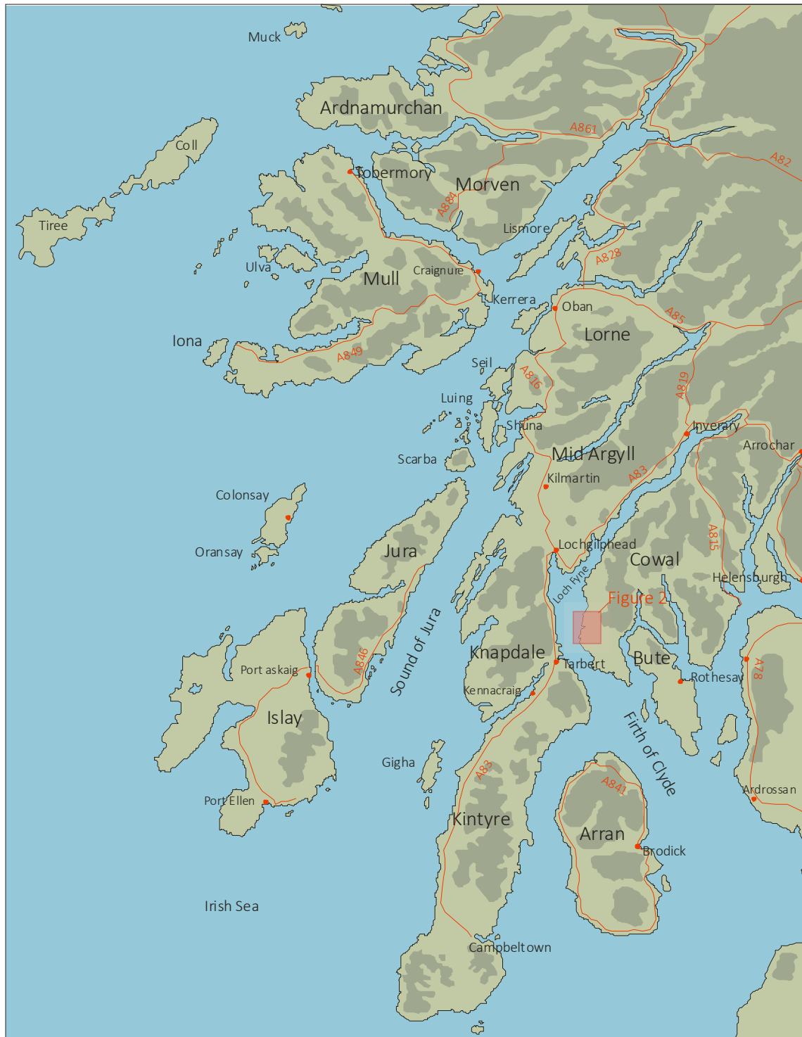
Figure 1: Area of Survey in Argyll