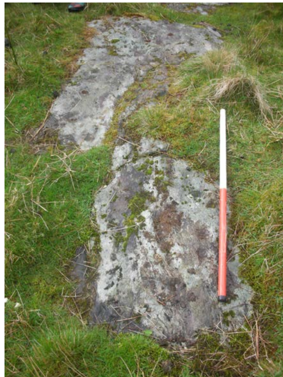
The cup and ring marked rock at Inveryne.

Possibly the earliest site within the study area is the chambered cairn at Ardmarnock Bay (Site 29) and this preference for bay locations is perhaps reinforced by the presence of the Standing Stones overlooking Auchalick Bay (Site 15), the bay also overlooked by the rock art panel at Inveryne (Site 11). This site, along with other reported rock art sites at An Fuaran (Site 5) and Auchalick Wood (Sites 23-26) and the cup marks at the chambered cairn at Ardmarnock (Site 29), means this area is relatively rich in rock art when compared to other parts of Cowal.