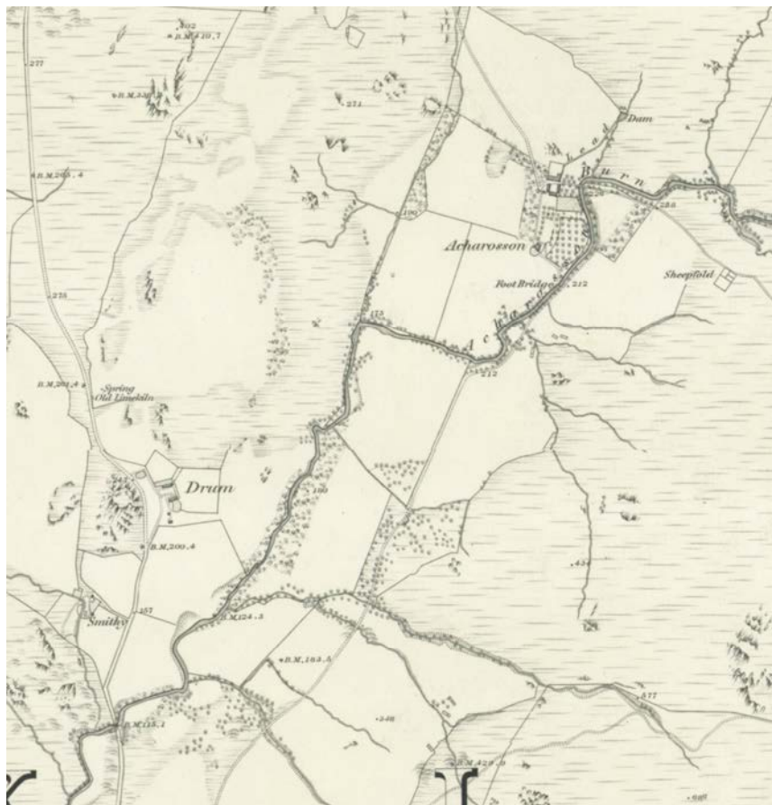
1st Edition Ordnance Survey Map (showing Drum and Acharossan with what is likely to be the now deserted settlements of Acharossan Mor and Acharossan Beg to the south of what is now Acharossan Farm).