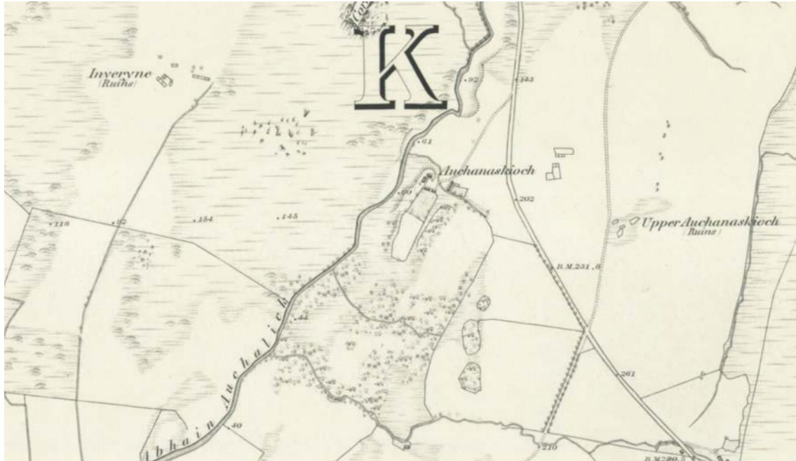
1st Edition Ordnance Survey Map (showing Inveryne and Auchnaskeioch).

The First Edition Ordnance Survey map (Argyllshire sheet CLXXXI) shows the area in much more detail and depicts the settlements of Acharossan, Auchnaskeioch, Upper Auchnaskeioch, Auchalick, Inveryne, Tigh-cladaich, Lower Auchalick, Upper Auchalick, and two settlements named Melldalloch. The map also shows two unnamed settlements, likely to be the remains of Acharossan Mor and Acharossan Beg.